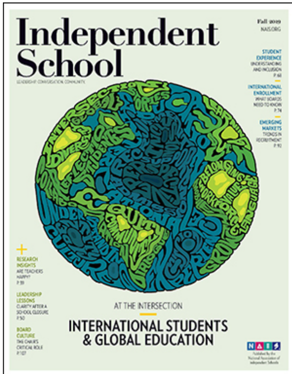
Fall 2019 International Students & Global Education