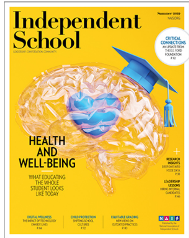
Summer 2019 Student Health & Well-Being